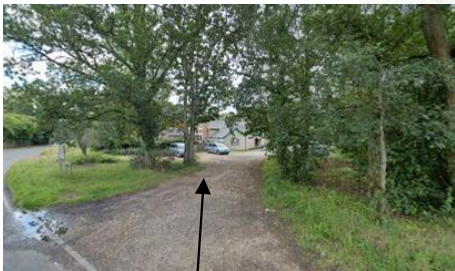
Entrance from Pamber Road